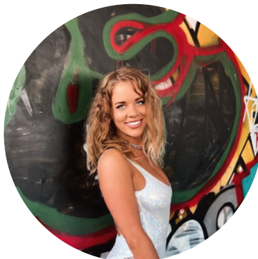
Beca Pressing Bachelorette, Beans Bar